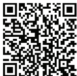
DMC Input Cards

Visit the product pages on the Crestron® website ( www.crestron.com ) for additional information and the latest firmware updates. Use a QR reader application on your mobile device to scan the QR image.