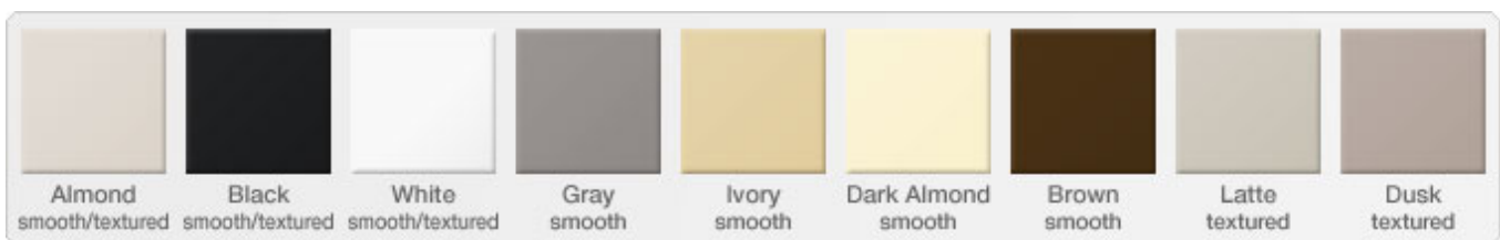
Cameo keypad colors and finishes (actual colors may vary)

Crestron infiNET wireless technology affords reliable 2-way communications throughout a residential or commercial structure without the need for physical control wiring. Employing a 2.4 GHz mesh network topology, each Cameo Wireless Keypad functions as an expander, passing command signals through to every other infiNET device within range (approximately 150 feet or 46 meters indoors), ensuring that every command reaches its intended destination without disruption.