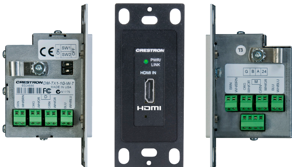
DM-TX1-1G – Left, Front, and Right Views

Input Resolutions, Interlaced: 720x480@30Hz (480i), 720x576@25Hz (576i), 1920x1080@25Hz (1080i25), 1920x1080@30Hz (1080i30), plus any other resolution allowed by HDMI up to 165MHz pixel clock