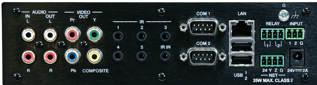
MC3 – Rear View

screen. Crestron control apps deliver the Crestron touch screen experience to iPhone®, iPad®, and Android™ devices, letting you safely monitor and control your entire residence or commercial facility using the one device that goes with you everywhere.