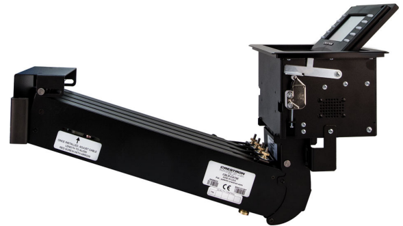
C2N-FT-TPS4 with CBLR Cable Retractors in Horizontal Orientation