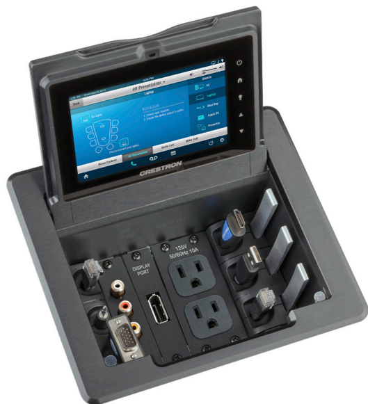
FlipTop FT-TS600 – Shown with 6 CBLR Cable Retractors installed