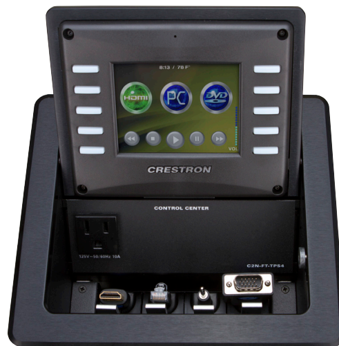
FlipTop C2N-FT-TPS4 – Shown with 4 CBLR Cable Retractors installed

Mounted vertically using CBLRA-BRKT-4-FT, including FlipTop Box with lid closed and all required mounting brackets: