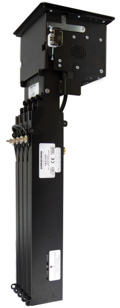
C2N-FT-TPS4 with CBLR Cable Retractors in Vertical Orientation