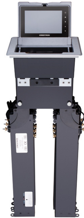
FT-TS600 with CBLR Cable Retractors in Vertical Orientation

Crestron, the Crestron logo, DigitalMedia, DigitalMedia 8G+, FlipTop, FlipTops, and QuickMedia are either trademarks or registered trademarks of Crestron Electronics, Inc. in the United States and/or other countries. HDBaseT is either a trademark or registered trademark of the HDBaseT Alliance in the United States and/or other countries. HDMI is either a trademark or registered trademark of HDMI Licensing LLC in the United States and/or other countries. Other trademarks, registered trademarks, and trade names may be used in this document to refer to either the entities claiming the marks and names or their products. Crestron disclaims any proprietary interest in the marks and names of others. Crestron is not responsible for errors in typography or photography. Specifications are subject to change without notice. ©2013 Crestron Electronics, Inc.