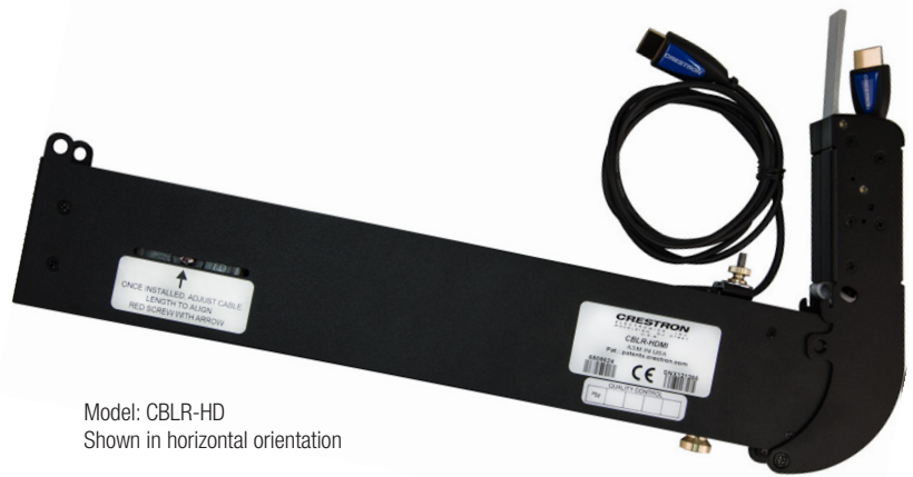
Model: CBLR-HD Shown in horizontal orientation

Crestron® Cable Retractors provide a convenient cable management solution for use with most Crestron FlipTops™. Using this solution, a user can simply reach into the FlipTop compartment and pull out any cable to the desired length. Each cable can be pulled out up to 3 feet (0.9 meter). A simple press of the easy-access lever retracts the cable back into the compartment.