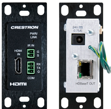
HD-TX3-C-B – Front & Rear View