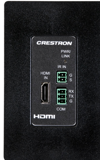
Wallplate not included

The HD-TX3-C handles uncompressed Full HD 1080p, Ultra HD, 2K, and 4K video signals with support for 3D, Deep Color, and HDCP. Audio capabilities include support for high-bitrate 7.1 audio formats like Dolby® TrueHD and DTS-HD Master Audio™ as well as uncompressed linear PCM. All signals are transported over a single CAT type cable, supporting 1080p, WUXGA, and 2K signals at distances up to 330 feet (100 m) using Crestron DM® Ultra or DM 8G® Cable, or third-party CAT5e. Higher resolutions up to UHD and 4K are supported at distances up to 330 feet (100 m) using DM Ultra Cable, 230 feet (70 m) using DM 8G Cable, or 165 feet (50 m) using CAT5e. [1]