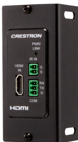
HD-TX3-C-B – With Mounting Bracket