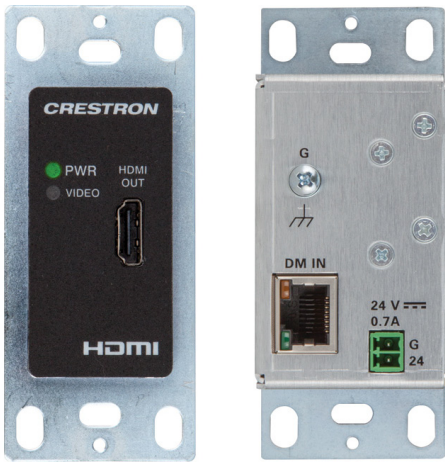
DM-RX1-4K-C-1G-B-T – Front & Rear Views