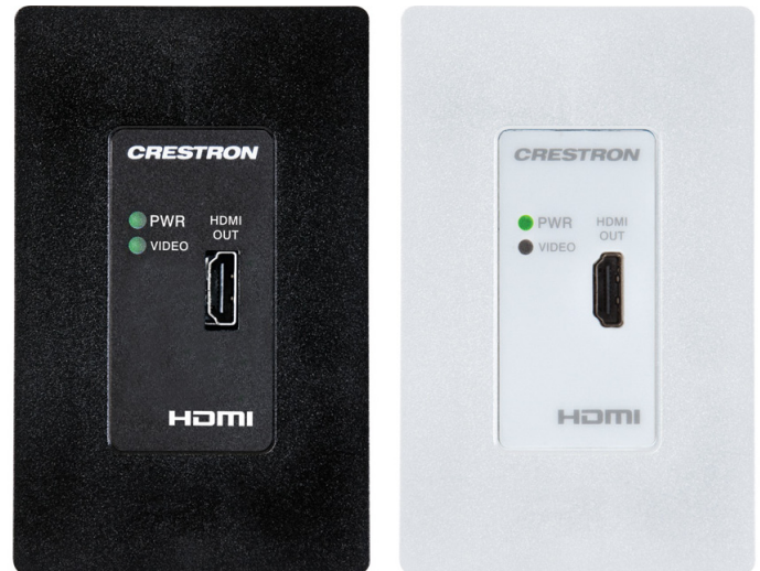
Shown in black and white; faceplate not included

As the leader in HDMI and control system technologies, Crestron developed DigitalMedia (DM®) to deliver the first complete HD AV distribution system to take HDMI to a higher level. DigitalMedia allows virtually any mix of HDMI and other AV sources to be distributed throughout a home, office, school, or virtually any other facility. The latest generation of DM is called DigitalMedia 8G™ (DM 8G®). Engineered for ultra high-bandwidth and