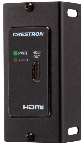
DM-RX1-4K-C-1G-B-T – With Mounting Bracket