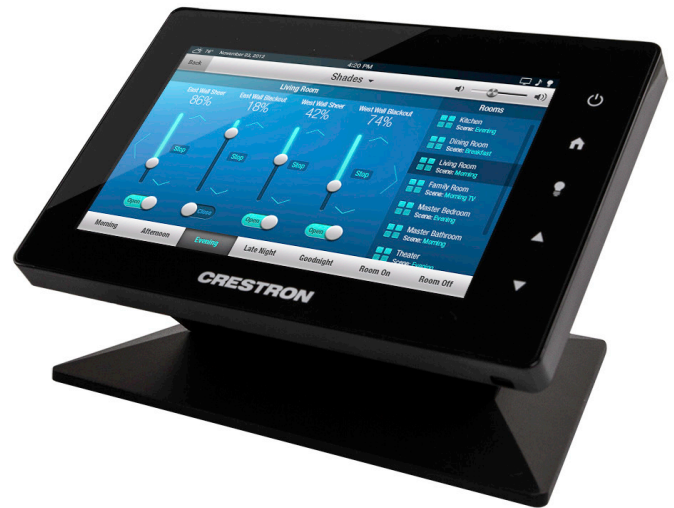
TSW-550-B-S with TSW-550-TTK TableTop Mounting Kit