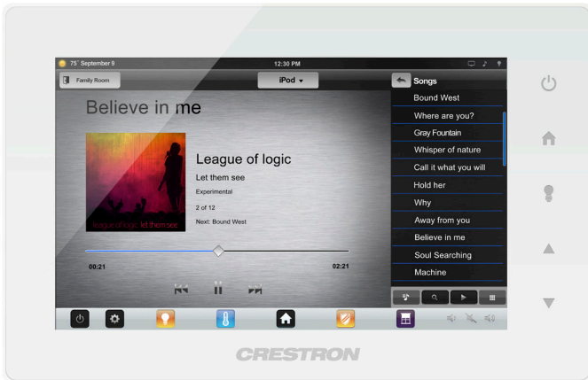
TSW-550-W-S – Shown in White