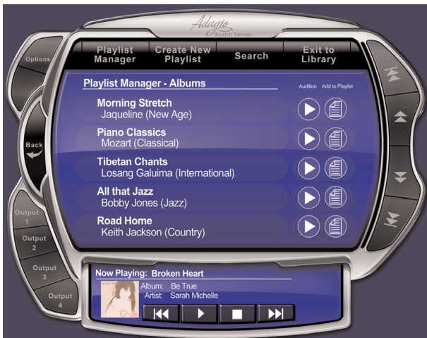
Playlist Manager: Sample a selection, add it to the list and even change the queue position. Create custom playlists for every member of the house and for any occasion.