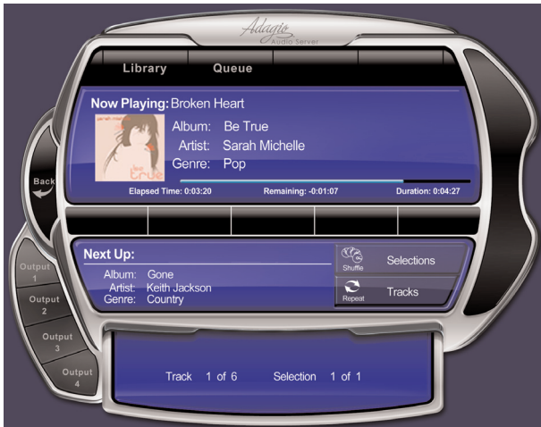
Full Player Screen: Displays all the information about the current selection, including elapsed time, time remaining, duration, track number, and playlist selection number. Advanced shuffle and repeat functions by songs and lists are featured.