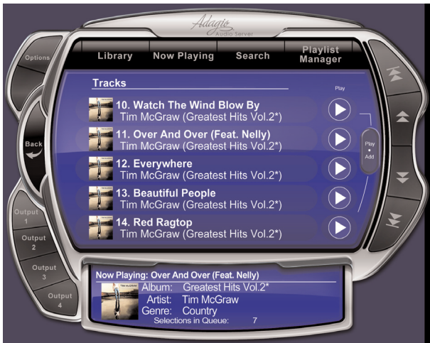
Browser Screen: Within the selected album, individual tracks can be selected, played immediately, or added to a playlist.