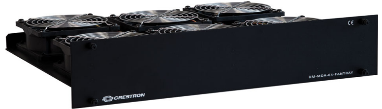
Model DM-MDA-64-FANTRAY shown

A DM-MDA-FANTRAY provides a backup replacement cooling fan tray assembly for a Crestron® DM-MD64X64 or DM-MD128X128 DigitalMedia™ Switcher. The DM-MDA-64-FANTRAY is the fan tray for the DM-MD64X64; the DM-MDA-128-FANTRAY is the fan tray for the DM-MD128X128. The DM-MD64X64 and DM-MD128X128 each ship with one fan tray included. On either switcher, the complete fan tray assembly can be swapped in seconds on-site without requiring any tools, and without shutting down or removing the switcher from the equipment rack.