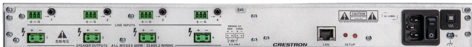
AMP-4600 – Rear View