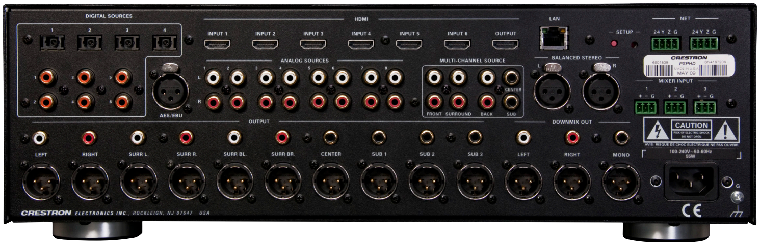
PSPHD – Rear View

As part of a complete Crestron® control system, this pairing streamlines programming while allowing for sophisticated remote control including the ability to view the detailed status of each amp channel from a Crestron touch screen.