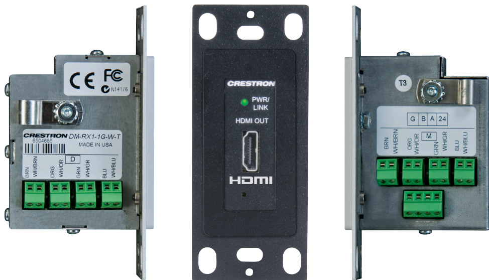
DM-RX1-1G – Left, Front, and Right Views