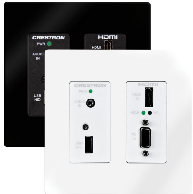
Faceplates not included.

1920x1200 pixels, as well as analog video up to 1080p60 [4] . A 1/8" (3.5mm) stereo audio input is included to accommodate analog audio signals from an unbalanced line-level source or headphone output.