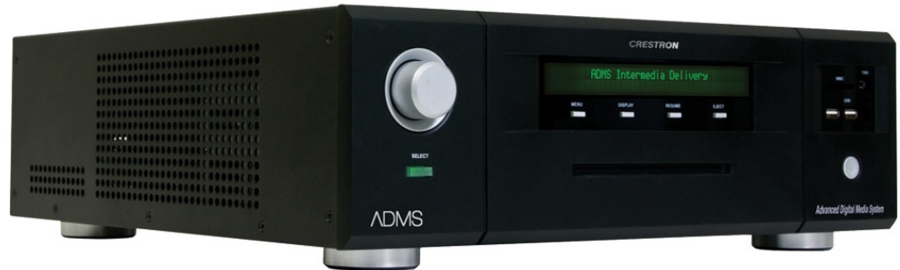
ADMS-BR model shown

Giving you the power to acquire and manage virtually any content you desire is what Intermedia Delivery is all about. The ADMS provides a streamlined solution for storing and playing all your digital videos, music, photos and home movies. It also delivers a seamless online experience, letting you rent major motion pictures from Netflix®, stream videos from YouTube® and Vimeo®, and watch your favorite news, sports, and TV shows through Hulu® and Hulu Plus [1] , Metacafe®, Comedy Central®, ESPN®, CNN®, and numerous other top providers. Built-in Web browsing completes the experience, giving you full access to all that the Internet has to offer without leaving the comfort of your home theater or living room sofa.