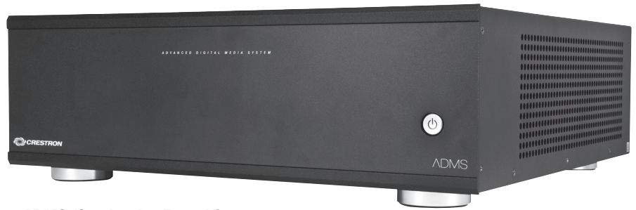
ADMS (faceless) – Front View

Of course, the ADMS affords seamless integration with your Crestron control system, unleashing a wide assortment of control options using Crestron handheld remotes and touch screens , or even mobile devices like the iPhone® , iPad® , or Android™ . Its onscreen keyboard allows simple one-handed navigation using any Crestron remote. A wireless touch screen affords the ultimate in control, reproducing the ADMS onscreen experience within a beautiful color touch screen complete with cover art and metadata. Adding touch screens throughout the house enables full access to your entire media collection from any room. Even video can be distributed to HD displays in any room using a Crestron DigitalMedia™ system. [3,4]