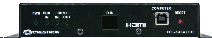
HD-SCALER – Right Side View