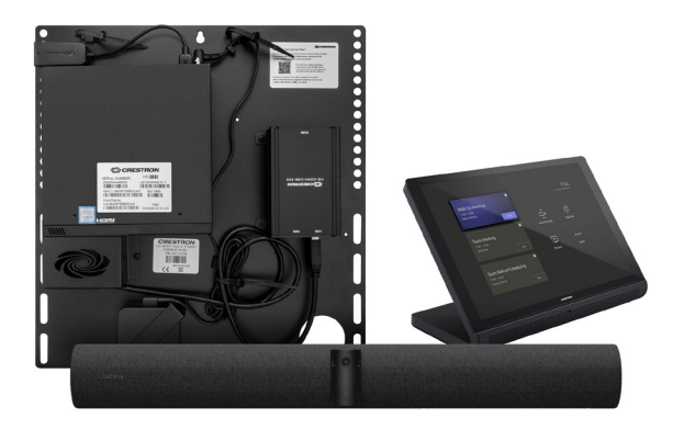
Crestron Flex Small Room Conference System (UC-B31-T)

The UC-B31-T Crestron Flex tabletop conferencing system provides a small room video conference solution for use with Microsoft Teams® Rooms software. It supports single or dual video displays1 (not included) and features a tabletop touch screen, Jabra® PanaCast 50 video bar, UC bracket assembly, PoE injector, and cables.