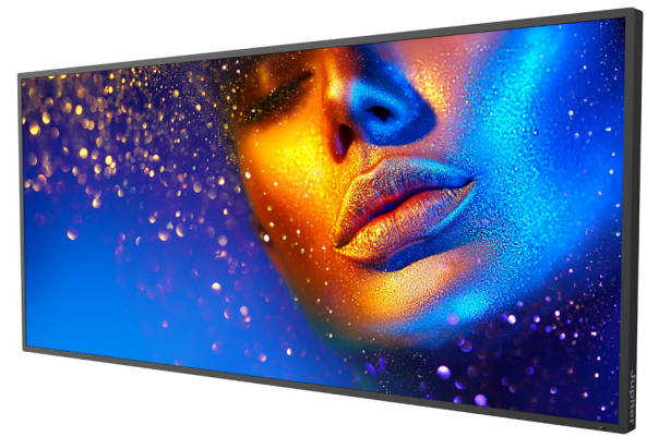
Jupiter Pana's 21:9 ultra-wide 5K (Pana 105")

We believe that 21:9 ultra-wide 5K LCD are the future for enterprise and are committed to leading the way in this space. The Pana is fully engineered and designed from the ground up by Jupiter; this allows us to work with market leaders such as Microsoft to create a fully integrated Signature Teams Room display and solution. Jupiter Pana displays are installed at over 50 Fortune 500 companies in over 22 countries (and growing), many in the Microsoft Signature Front Row MTR configuration.