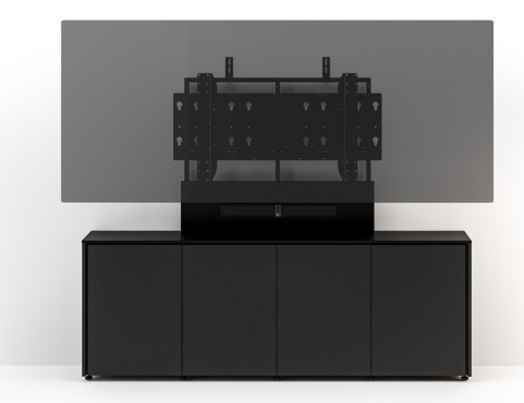
Salamander Designs Credenza, Siena Black Oak

All pieces are built to order, manufactured in the USA and backed by a Lifetime Warranty. Customize your own by selecting from our wide variety of styles, materials, sizes and finishes of furniture to support technology, unified communication and maximum user engagement with designer style.